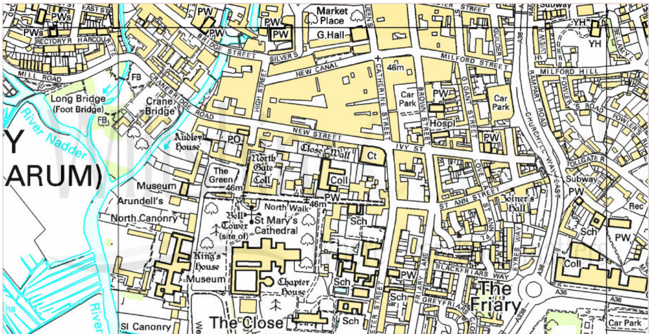
N ↑ 19A The Close Salisbury