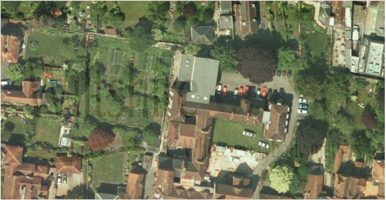
N ↑ 19A The Close Salisbury